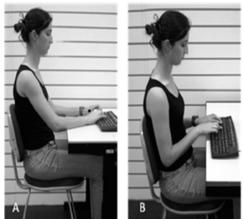
* C.U. Sao Camilo – Motion Analysis Laboratory